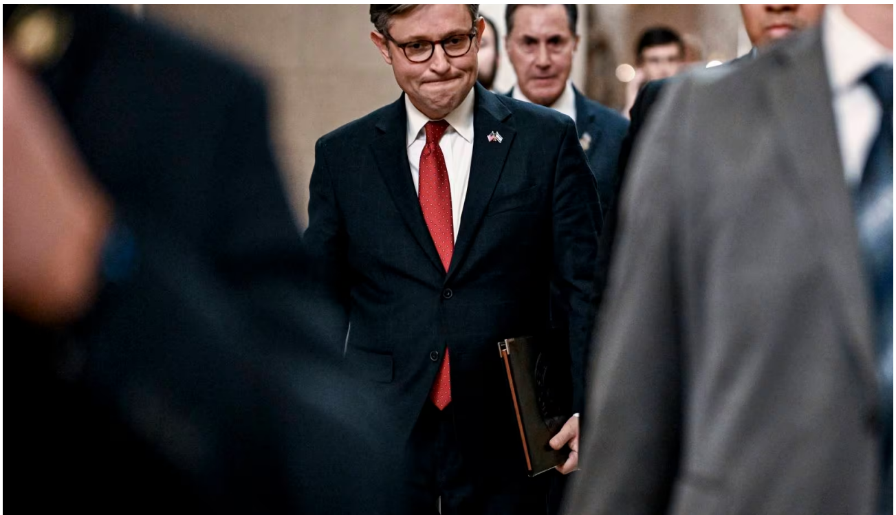
House Speaker Mike Johnson.